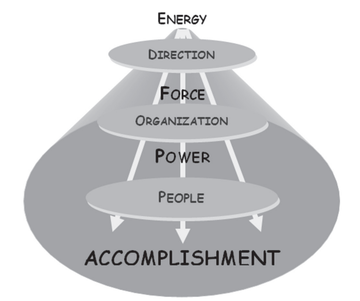
Figure 1: How Energy is Converted into Accomplishment

civilization on a single location to optimize access and interrelationship. Zbigniew Bochniarz cites research on the power of industrial clusters and city networks on climate change to illustrate the important role played by networks in the process of social development.* Banks such as Visa and Mastercard cooperate to compete by providing credit card transfers to billions of people through millions of merchants and tens of thousands of banks. Each bank retains its autonomy and competes for business with other members of the network, yet all benefit from the operation of a shared global information and money transfer system that achieves high speed and efficiency and minimum cost to banks, merchants and customers.